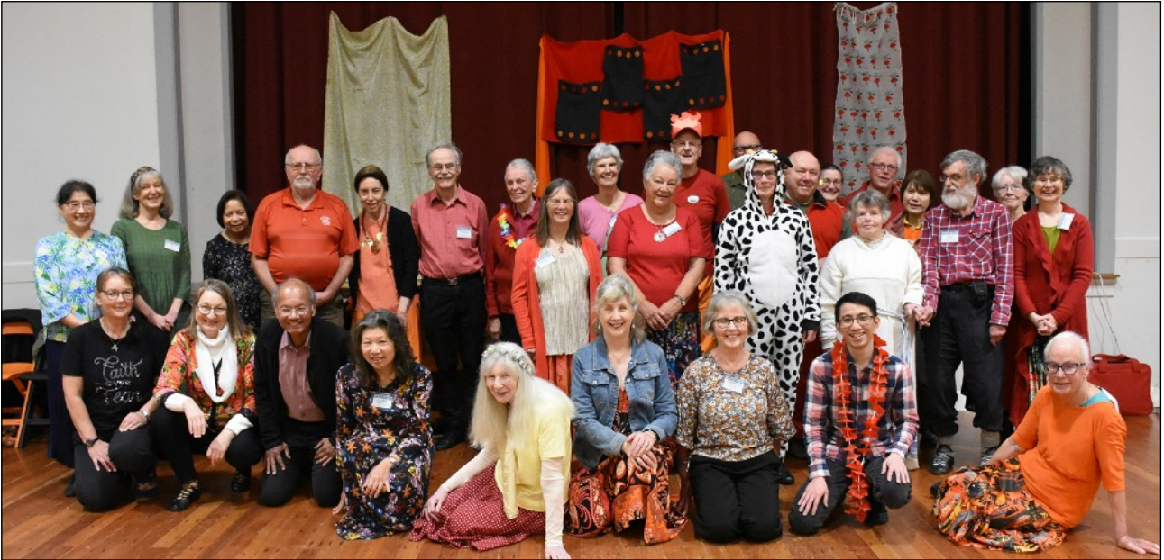
Johnsonville's brightly dressed Beltane dancers

The dancers were also dressed in the colours of spring and fire, and we even had a couple of fetching “cow” costumes to complement the growing collection of cow ornaments.