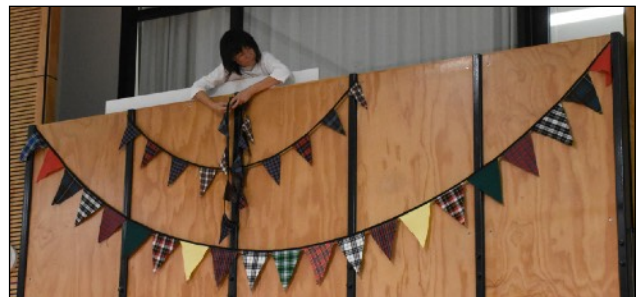
Decorating in progress for our April Tartan Night