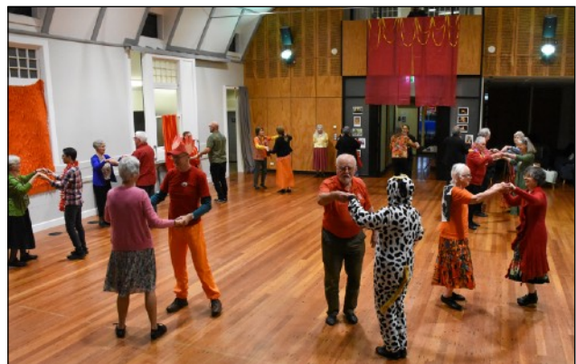
The Spring Chick Waltz turned out to be more challenging than expected

Our April Tartan Night , the first for the year, didn't go quite as planned. While the weather wasn't too bad around Johnsonville itself, it soon became apparent that the severe storm on 20 April was causing chaos around the Wellington region, so we made the decision to cancel. Fortunately for us, the band was available the