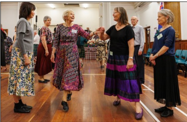
The Gentleman