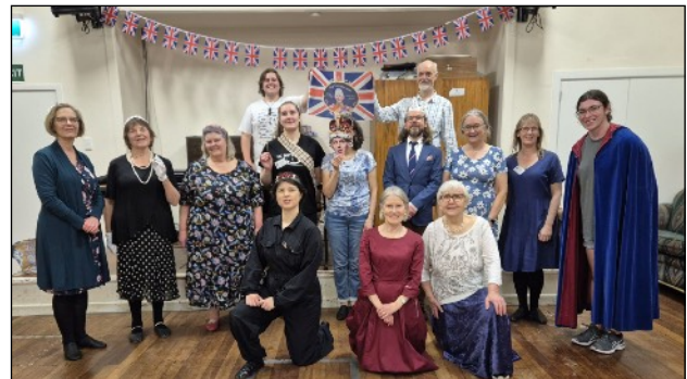
Some of the Linden Club members dressed for the royal theme

Linden SCD Club celebrated King's Birthday on 1 June with a lively royal-themed evening. Union Jack bunting was hung above the stage, and dancers arrived dressed for the occasion in crowns, tiaras, royal colours and tartan.