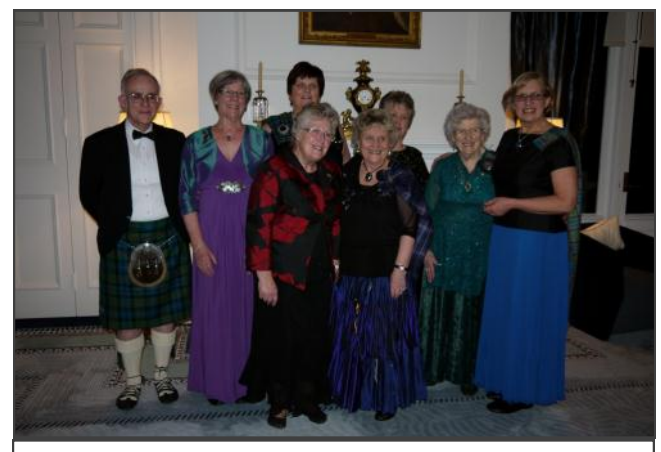
Thank you to the tremendous organisers of this wonderful evening! (shown here in The Blundell Room).

Next day was the 1st of July ... back to 'auld claes and porridge' as they say, but 'they can't take the memory away from us'!