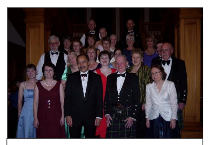
Members of Lower Hutt Club with Sir Jerry Mateparae on the grand staircase leading up from the Main Hallway.

Suppertime gave us all another memorable experience – the opportunity to wander along the very long hall with its glorious red carpet, and explore the beautifully appointed rooms leading off it. The stunning Norrie Dining Room had a spectacular dining table, which, with all its extensions in position can comfortably seat 26. It was impressive to even just sit at it (the chair backs had all been worked by Country Women's Institute members, each emblem reflecting their local town).