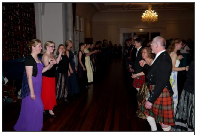
Dancers flocked on to the floor until the very end of the evening.